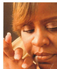
Emmanuel Covenant Church

We felt the giving commitment of our members start to weaken last summer. One the creative ways that our church