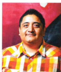
Iglesia Evangelica Bethel

We have never had to challenge adults in the church to give to our youth ministry but we felt like it was time. Annually we have a summer internship where youth have to pay to participate but they just didn't have the money this time so I went before the congregation and challenged them to generously help our youth and the donations started to pour in. Then I began to ask for help from area businesses and they started to give also. But we did not stop there. We created the "$5 donor" program for adults to give $5 as often as they liked. Although it was humbling for us, we believed it to be affordable and we got a lot of $5 donations. I called it the 'faith project'