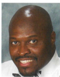
Reid Temple AME Church

Some of the creative ways that have worked for us include collaborations with other churches and parachurch